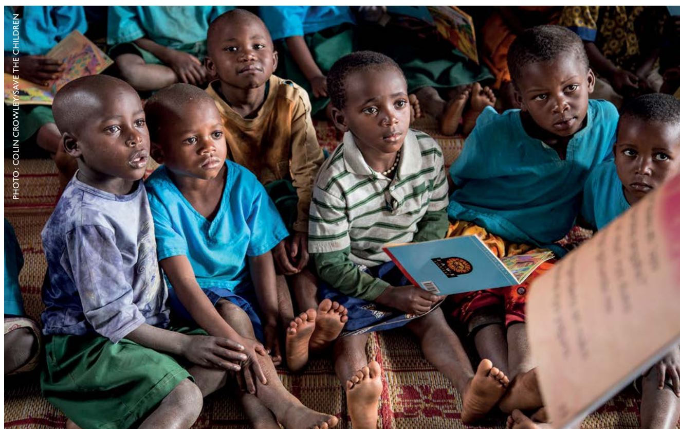
Children at an early childhood care and development centre in Burera, Rwanda supported by Save the Children.

left behind. The groups should be identified through open, inclusive and participatory processes linked to post-2015 monitoring and accountability systems at the national and international levels. Particular attention should be given to the context, taking into account historical trends and reasons why some groups are left behind. In many low-income countries, the aim of the stepping stone targets would be to considerably accelerate recent rates of progress. 15