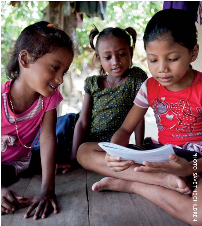
Children in class at a Save the Children supported school, Estancia, Iloilo, Philippines.

The poorest children are four times more likely to be out of school and five times more likely not to complete primary education than the richest. 13 Monitoring progress through national average rates has hidden wider inequalities among groups – in particular, those with multiple forms of disadvantage. For example, as Figure I shows, average rates of reduction in the number of children never to have attended school mask the fact that the poorest girls are still most likely to miss out.