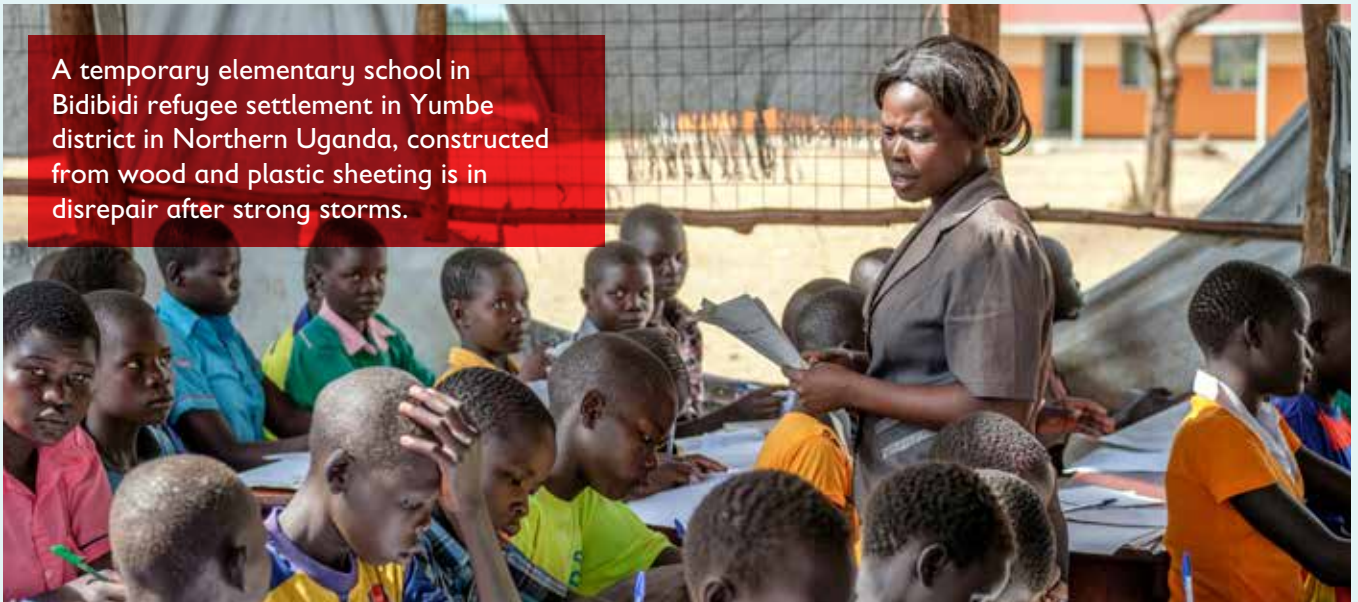
A temporary elementary school in Bidibidi refugee settlement in Yumbe district in Northern Uganda, constructed from wood and plastic sheeting is in disrepair after strong storms.